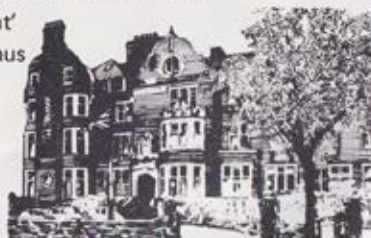
'at the end of the famous Leas' Free Parking